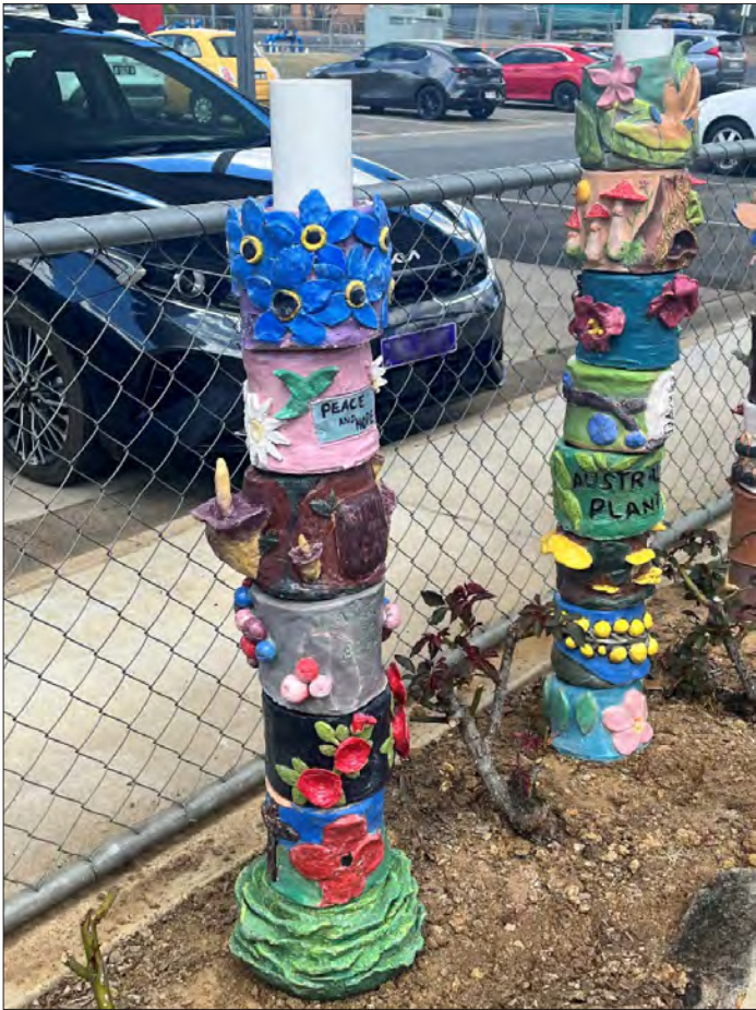
12 VAP class totem poles

The totem pole will remain as a collaborative art piece made by the VAP class of 2023 and will be identified and viewed by later classes in the future. The totem pole will educate viewers about different native flowers and plants of Australia. It will also inspire viewers to learn the meanings of flowers and their language.