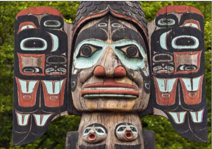
Native American Totem Pole

Totem poles are designed by the Native American people to display different meanings and purpose. Cultural beliefs or commemorating ancestors are popular reasons for their construction. These totem poles were usually carved from wood. The VAP Class of 2023 created two totem poles with the themes “Native Australian Plants and Flowers” and “The Meaning of Flowers” chosen by the students. These poles suit Nanango’s environment as they come from the land and fit along with the other totem poles.