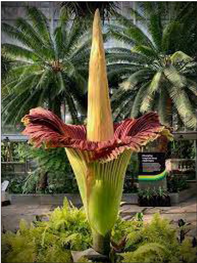
Corpse Flower Plant

and water, was put on both crossed sections and the clay was bound to the pole. After the details were added, a sponge with water was used to smooth out the bumps, and the sculpture was left to dry. Then it was bisque fired and cooled. Next, the sculpture was under-glazed with colour and dried before a final white glaze was added. I chose yellow, brown, green, and purple for this sculpture’s colour scheme as they were the colours from the flower. The final step was another thin firing. My section of the totem pole fits the theme of Language of Flowers, as the Titan Arum’s meaning of Birth and Death relates to the theming. The placement between the Library and Admin is suitably placed alongside other totem poles in the area.