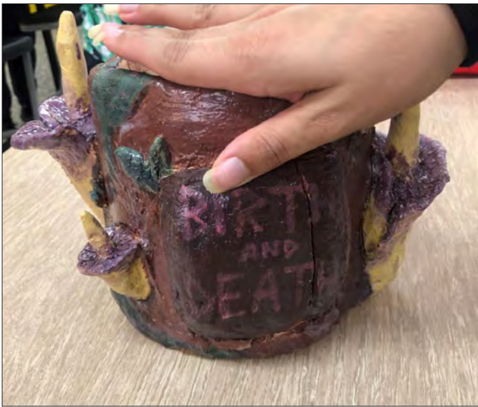
The totem pole of Titan Arum

The totem pole will remain as a collaborative art piece made by the VAP class of 2023 and will be identified and viewed by later classes in the future. The totem pole will educate viewers about different native flowers and plants of Australia. It will also inspire viewers to learn the meanings of flowers and their language.