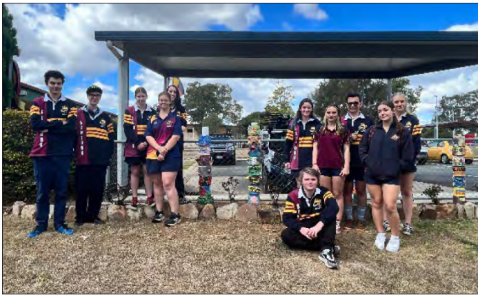
12 VAP class and their totem poles